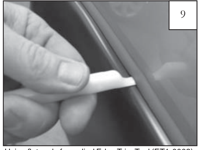
Using flat end of supplied Edge Trim Tool (ET1-0002), seat edge trim against flare by inserting straight end between edge trim and flare at one end. Next, slide around entire edge to the other end.