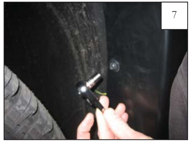
Holding flare in position on fender, reinstall factory screws removed in Step 4.