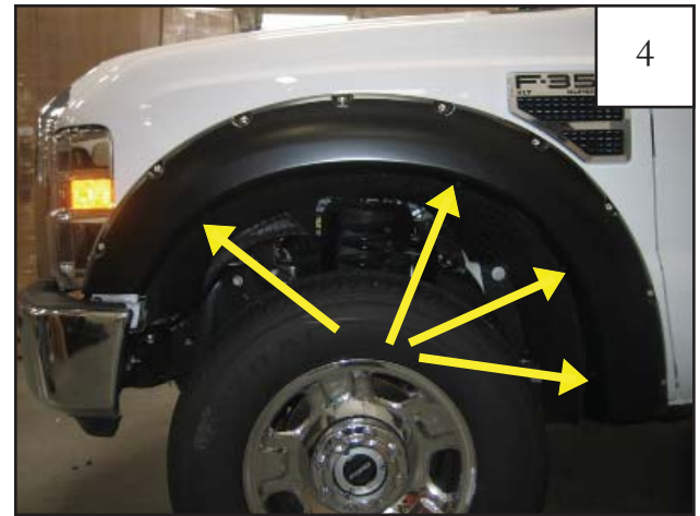
Remove four factory screws with a 7/32" socket wrench. Save screws for reinstallation.