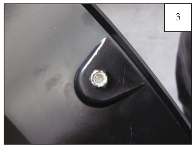
Place a Nut (NU1-0019) over the end of each Bolt and tighten, using a 1/2" wrench for the Nut and the supplied Torx Bit (SW1-0052) for the Bolt. Repeat for remaining pockets.