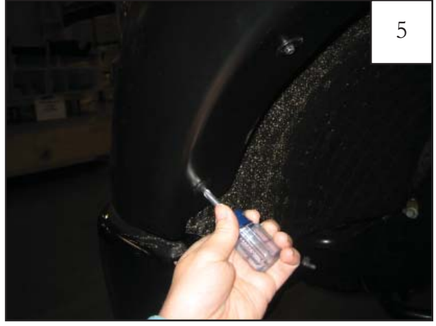
Using a #2 Phillips Screwdriver, install two supplied Tufloks (RV1-P001) through additional holes in flare and into fender. NOTE: Use a push-twist motion.