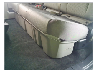
This is how the DU-HA should look installed under the back seat.