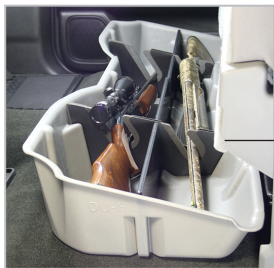
2 shotguns or rifles, 1 with scopes, will fit in the gun rack, as pictured.

Warning: Seat bottom must be down at all times while vehicle is moving. Make sure the DU-HA is secured in the vehicle according to installation instructions. Do not store explosives or hazardous materials in the DU-HA. Do not place loaded guns in the DU-HA. For further instructions refer to truck owners manual or contact DU-HA, Inc.